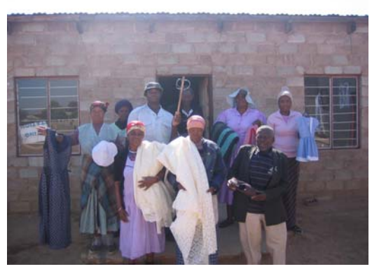
Lewfontein Luncheon Club located at Itsoseng, is one of AMREF's partners in Sekhukhune. The club is a place for the elderly to come together and produce arts and crafts.

Orphaned and vulnerable children (where "vulnerable" refers to any child who is neglected, abused, or in need) are the beneficiaries of the programme.